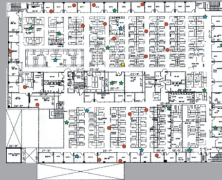
OPTIMIZED FLOOR PLAN WITH ENCOMPASS

The result is a comprehensive fleet optimization analysis. A complete detailed blueprint that creates the most efficient and effective fleet of new and existing equipment, as well as in-depth strategies for managing your systems with maximum flexibility and productivity. All at minimal cost - giving you maximum control over your entire document workflow.