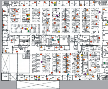
FLOOR PLAN BEFORE ENCOMPASS

A powerful, five-step analytical program, Encompass identifies inefficiencies such as redundant, underutilized and outdated equipment, overly expensive color and laser printers, and the hidden costs of outsourced support and supplies.